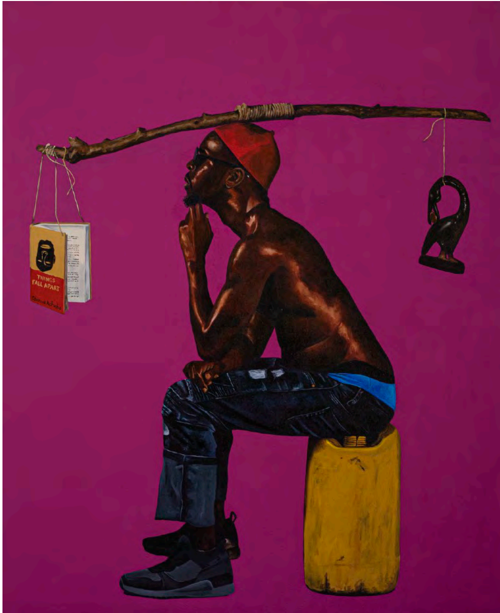
Things Fall Apart 2020, Acrylic on canvas 60 x 48 in / 152 x 122 cm