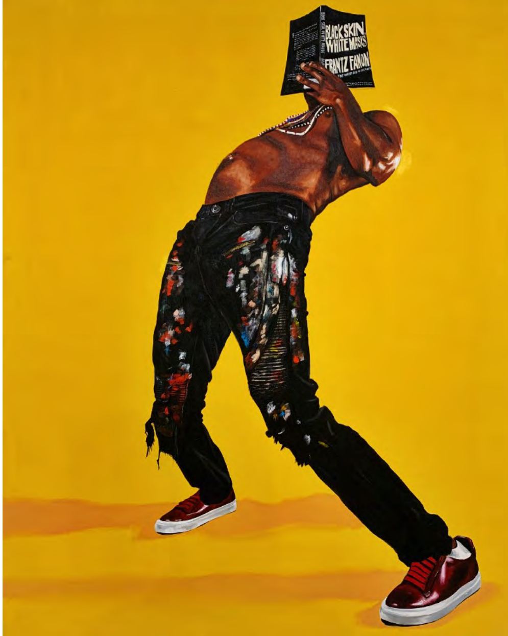
Black Skin White Masks 2020, Acrylic on canvas 60 x 48 in / 152 x 122 cm