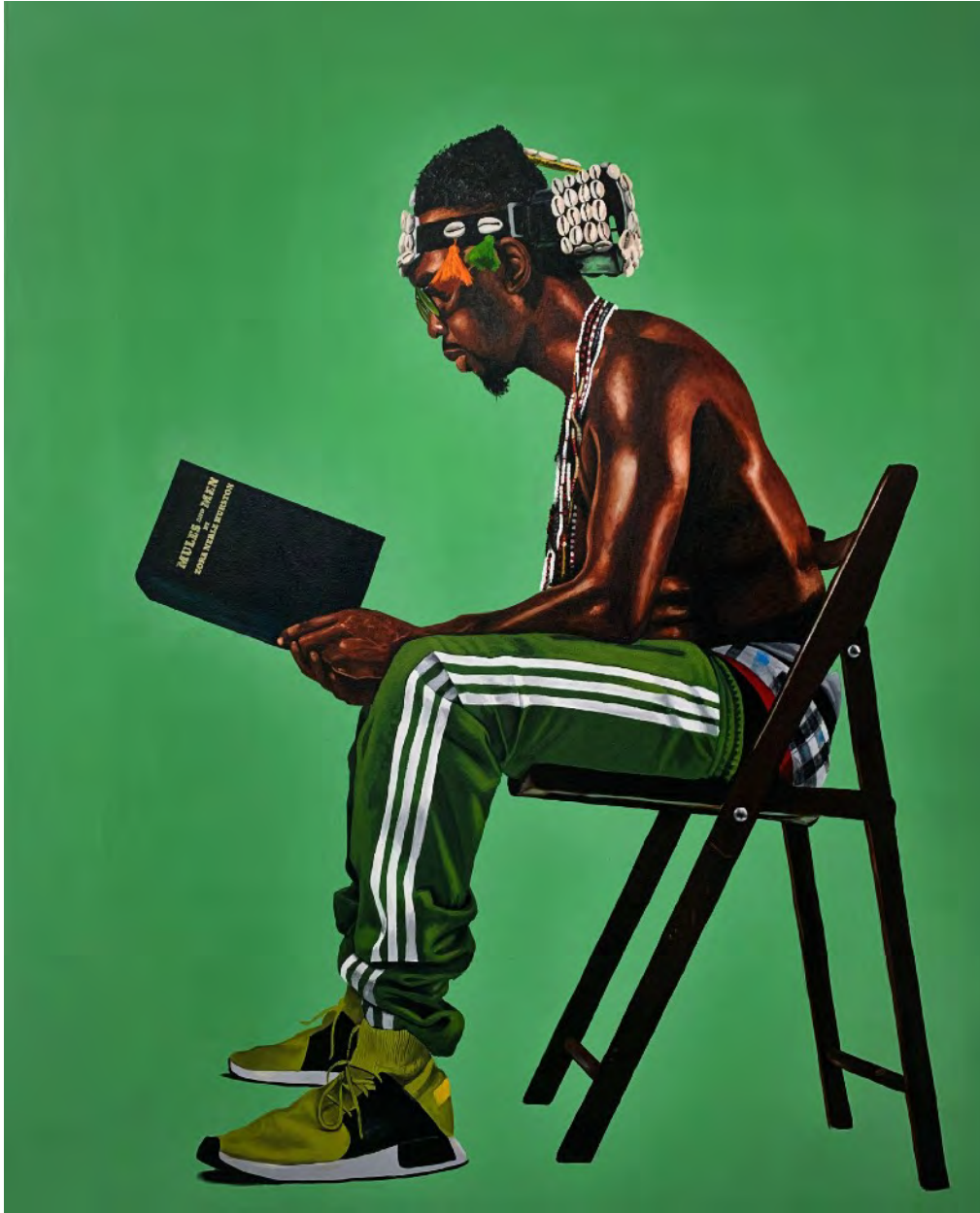
Mules and Men 2020, Acrylic on canvas 60 x 48 in / 152 x 122 cm