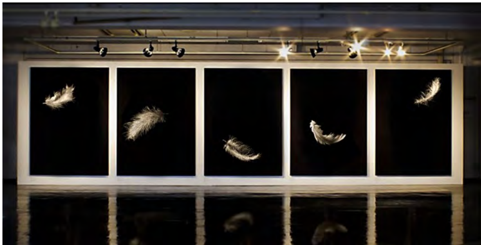
Digital rendering of Aves installation