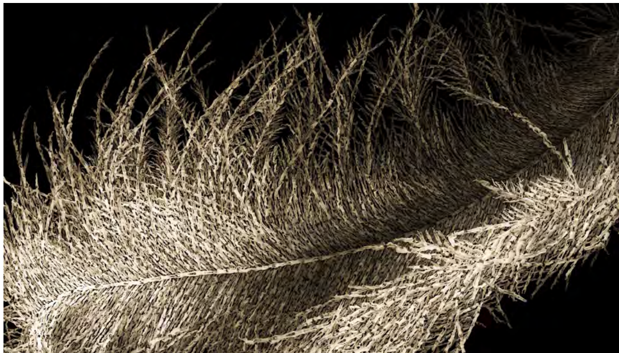
"P1 (Aves)" Detail of the feather composition