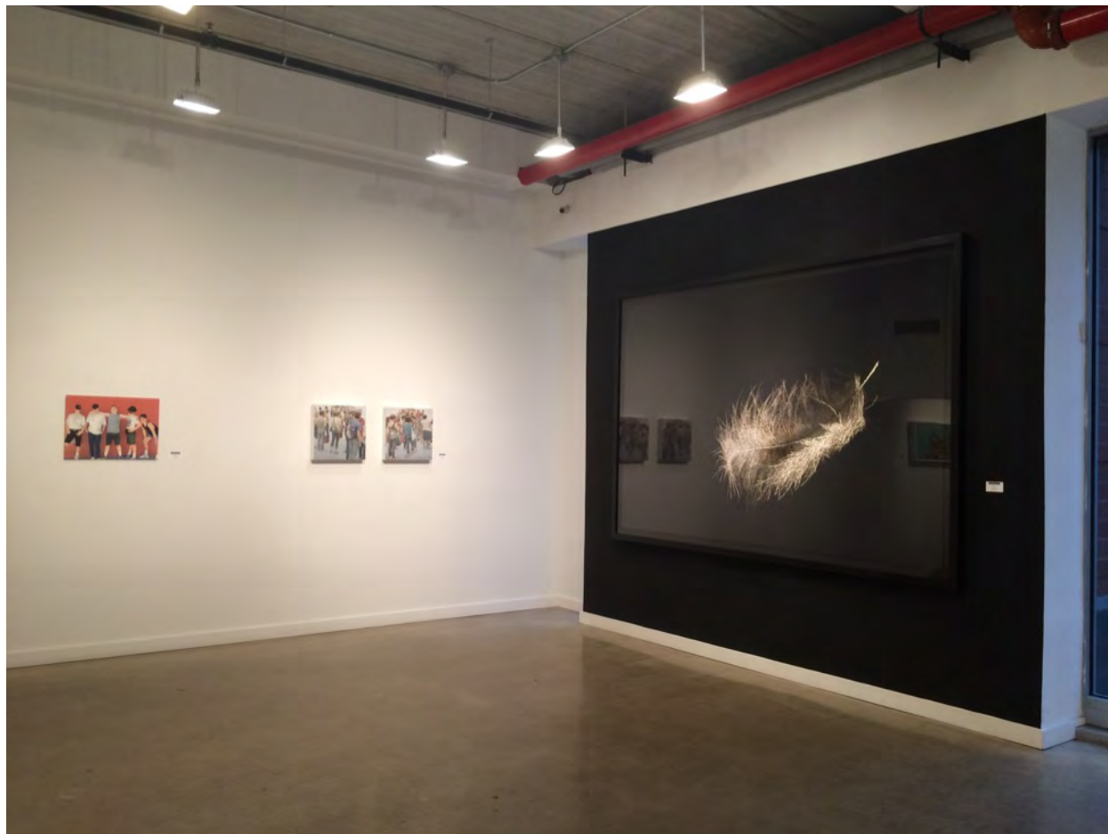
"P1 (Aves)" - Gallery installation